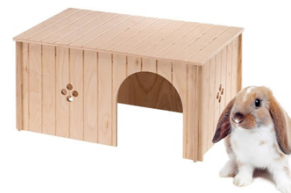
Rabbit Hidey house