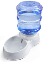
Pet water dispenser