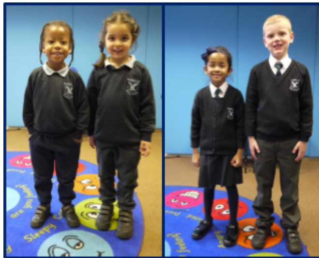
Winter Main Uniform