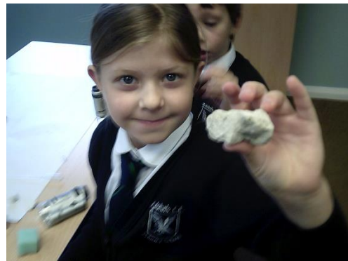
Y3 Rock workshop..."I never knew learning about rocks could be such fun!"